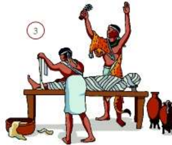
3 Body enfolded in bandages.