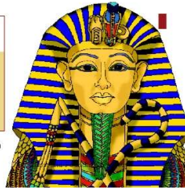
Mask of an Egyptian Pharaoh

The ancient Egyptians believed that when a Pharaoh died, his soul continued to look after his kingdom. To ensure that the Pharaoh would continue to enjoy the blessings of the Gods, his body was wrapped and preserved through an elaborate process called mummification and his body was placed inside a mighty pyramid that had already been constructed to protect the Pharaoh’s body.