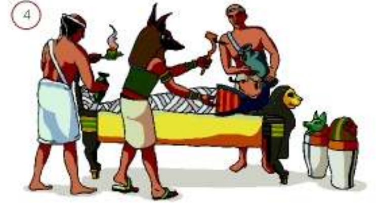
4 Face covered with a mask. A priest dressed like God Anubis, prays for the dead person.