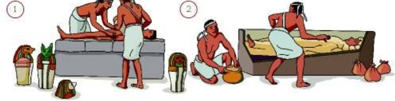
1 Internal organs are removed and put into canopic jars.